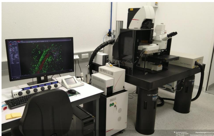
SP8 2Photon

2-photon microscopy makes use of long-wavelength light produced by infrared (IR) excitation lasers. At the level of physics two photons, with half the energy i.e. the double wavelength are used for the excitation of the fluorophore (in standard confocal, STED, AiryScan there is always one photon used). 2-Photon microscopy allows imaging deep into tissues with highest sensitivity thus depicting finest details of cellular and subcellular processes (for more information visit